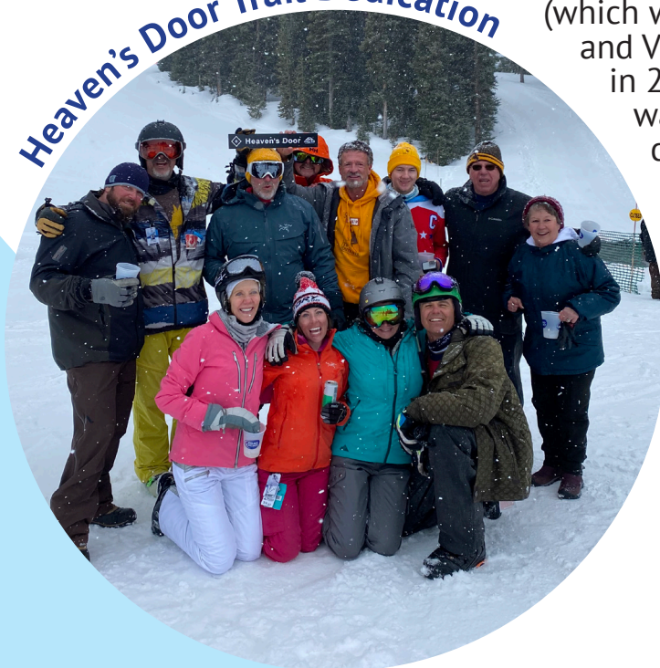
Heaven's Door Trail Dedication